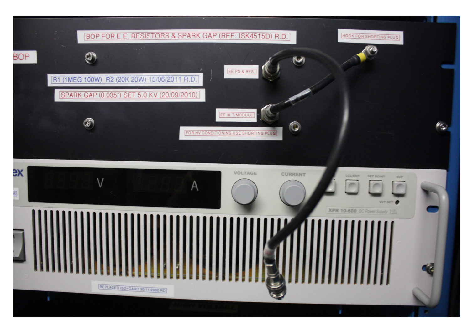
Figure 4 - Configuration for High Voltage Condtioning. The panel shown is located in the east target station Faraday cage in the ISAC-I Electrical Room.

Before HV conditioning starts, the Extraction Electrode must be configured as in Figure 4, unless stated otherwise by the Ion Source expert.