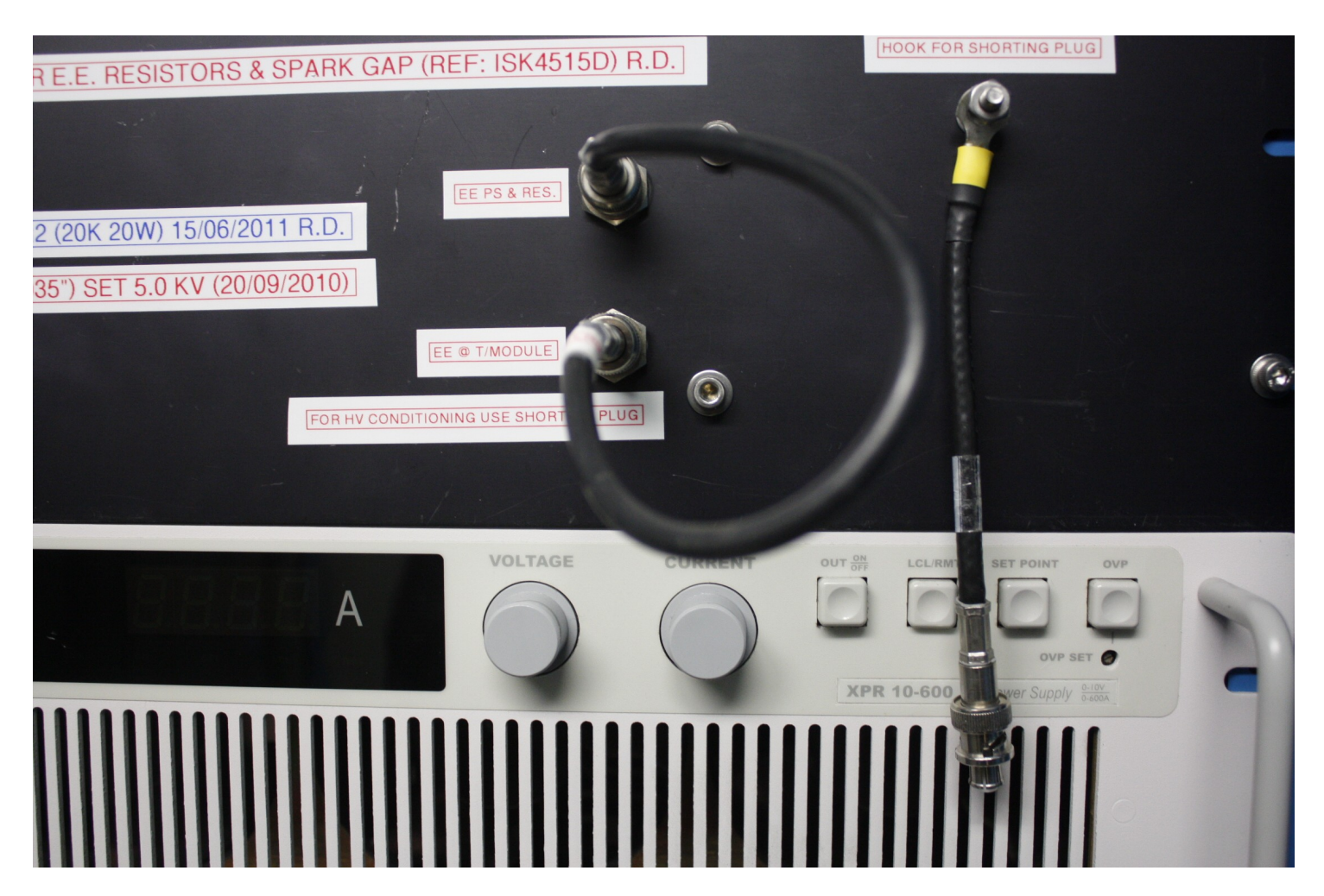
Figure 3 - Configuration for Heater Conditioning and Normal Operation. The panel shown is located in the east target station Faraday cage in the ISAC-I Electrical Room.

During Heater Conditioning and Normal Operation, the output from the ITE:EE power supply is connected to the ion source Extraction Electrode (see Figure 3).